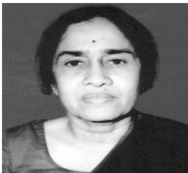
Kamala Sohoni (18 June 1912 – 28 June 1998)

Kamala Sohoni obtained her PhD in 1939 from Cambridge University. Her acceptance into and work at the Indian Institute of Science, Bangalore, paved the way for women to be accepted into the institution for the first time in its history.