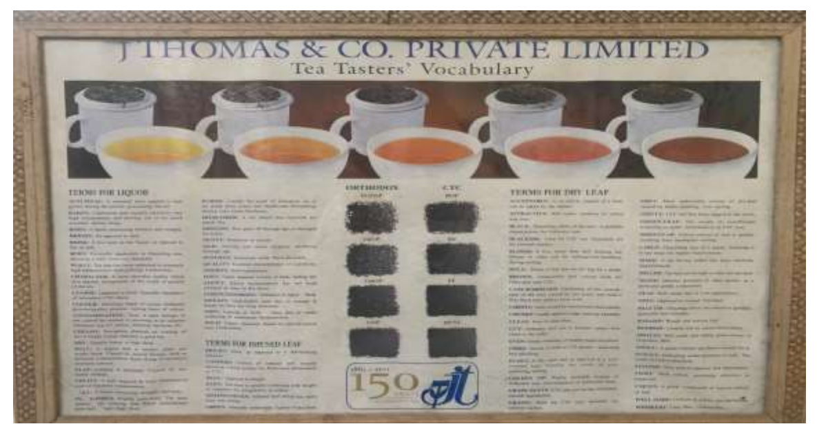
Plate 4: 'J. Thomas & Co. Private Limited - Tea Tasters' Vocabulary'

This glossary of tea words, in total longer and more detailed than Plate 4 is showing, functioning as an economic instrument, was introduced during the colonial time (Besky, Sarah.2020). As such, Besky describes it as an experimental moment and method, aiming to sustain resources and make them more durable. In that period, the glossary emerged step by step, based on the joint work of scientists and tea-experts. Based on this mode of emergence and behaviour, brokers can be described as "arbiters of quality". As such, a certain recognition and prestige comes along with their praxis which can be seen in their behaviour and expression until today. It is not the persons themselves benefiting from this procedure, but rather the job that comes with it.