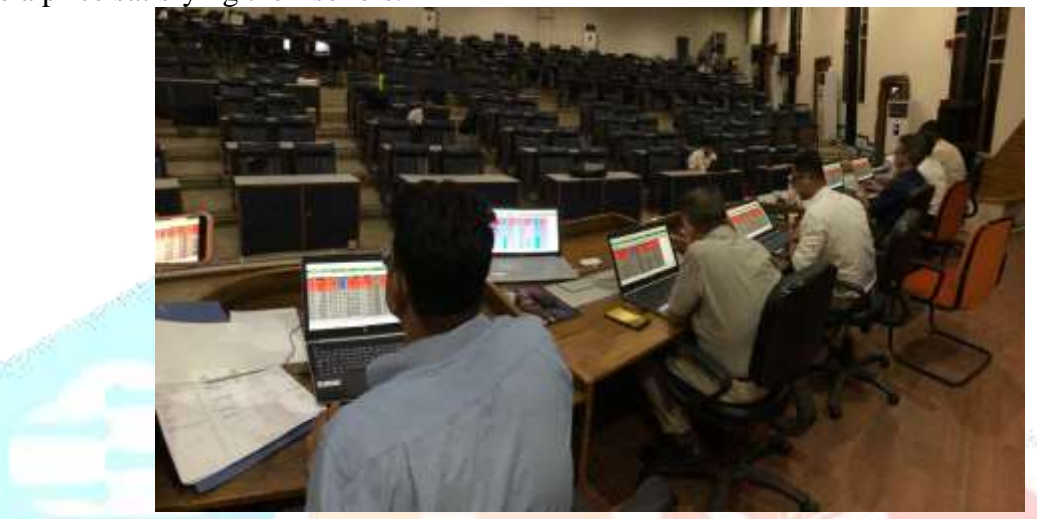
Plate 5: Guwahati Tea Auction Centre.

In the Bharat model, the price increases automatically in set price increments and set time intervals while the reservation price is to be set by the tea testers before the auction starts and cannot be changed during the auction (P.T.I, 2023). The latter is, besides the automatic increase of the price, also one of the major differences between the Bharat model and the English model. However, the basics of the auction remain true until today. Brokers acting as middlemen have the responsibility to sell the tea on behalf of their clients and to realize a price satisfying their sellers.