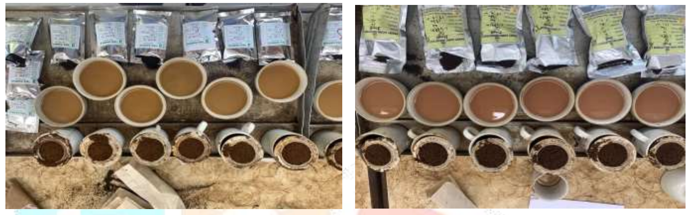
Plate 2 (left) and Plate 3 (right) Captured by authors during J. Thomas tea tasting: On the left a rather yellowish tea, on the right a rather pinkish one.

After the first impression via the three mentioned characteristics, the actual tasting takes place. Therefore, the tea should have a drinkable temperature between 30 and 40°C. The broker slurps and sips the tea and spits it out almost immediately. Then they mention a few keywords to characterize the tea and move on to the next sample. All this procedure underlies standardized rules and methods. This applies not only to the testing procedure itself, but also to the behaviour and approach of the tasters. Besky describes the evaluation of tea as a "real-life experiment", in order to justify the quality of the tea and the role of the broker as an 'expert'(Besky, Sarah.2020). From her point of view, the existence of a broker is an experimental test. This requires a standardized method of brewing the tea. It starts with the amount of tea to prepare a cup, goes through the brewing time, up to the amount of milk added per cup. Those kinds of standards are reflected in a kind of lexicon or lexical index. In this framework, not only the concoction of the tea, but more importantly the behavior of the taster and the wording used during the tasting have their very own, standardized approach and conduct.