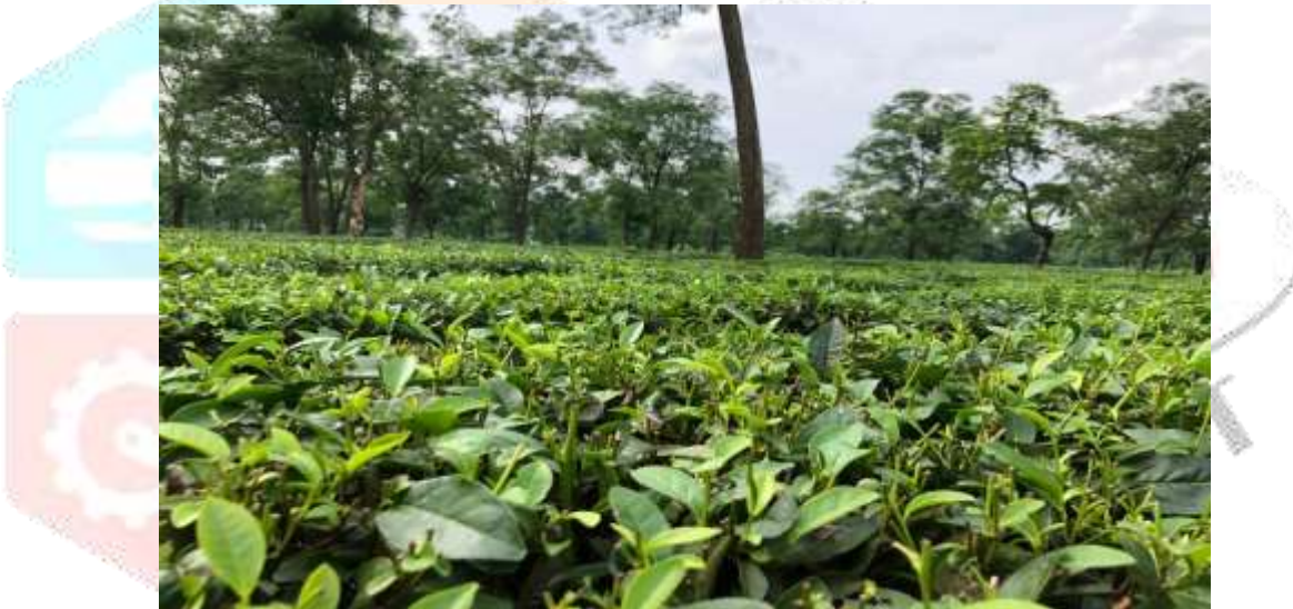
Plate 1: Gopalkrishna Tea Estate.

However, the magic word 'Tea' is associated with many pages of history, inventions and social customs, minor events and interesting tales. Moreover, on the other hand tea was also associated with immense development of commercial and capitalist exploitations as well as foreign investment in underdeveloped economies during