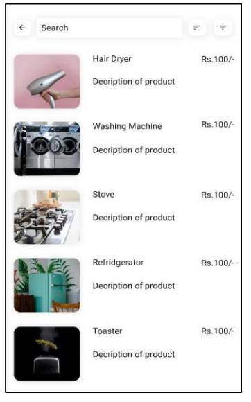
Figure 5.3: Product Listing