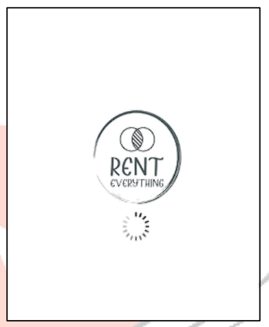
Figure 5.4 : Main Logo