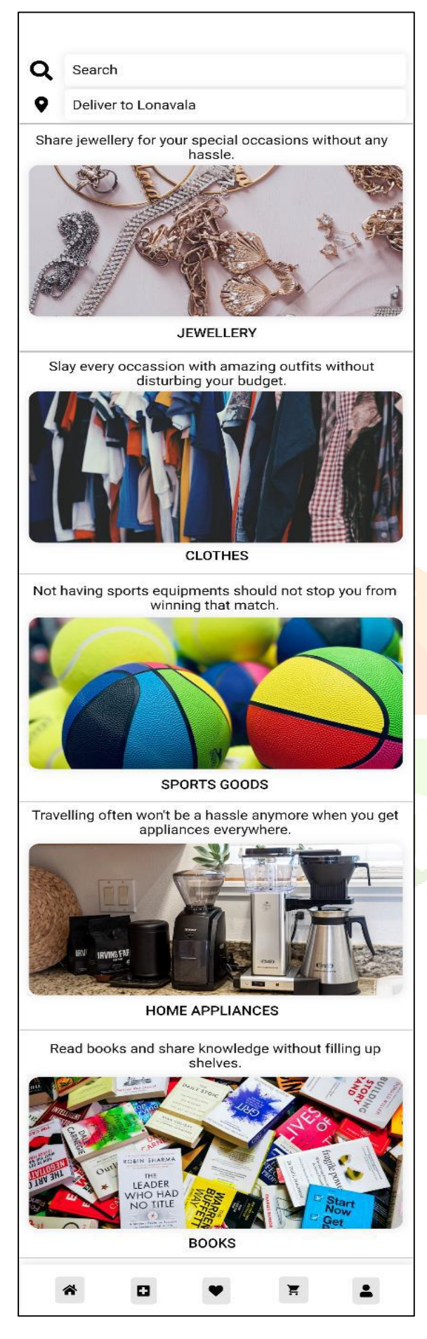
Figure 5.2: Main Menu