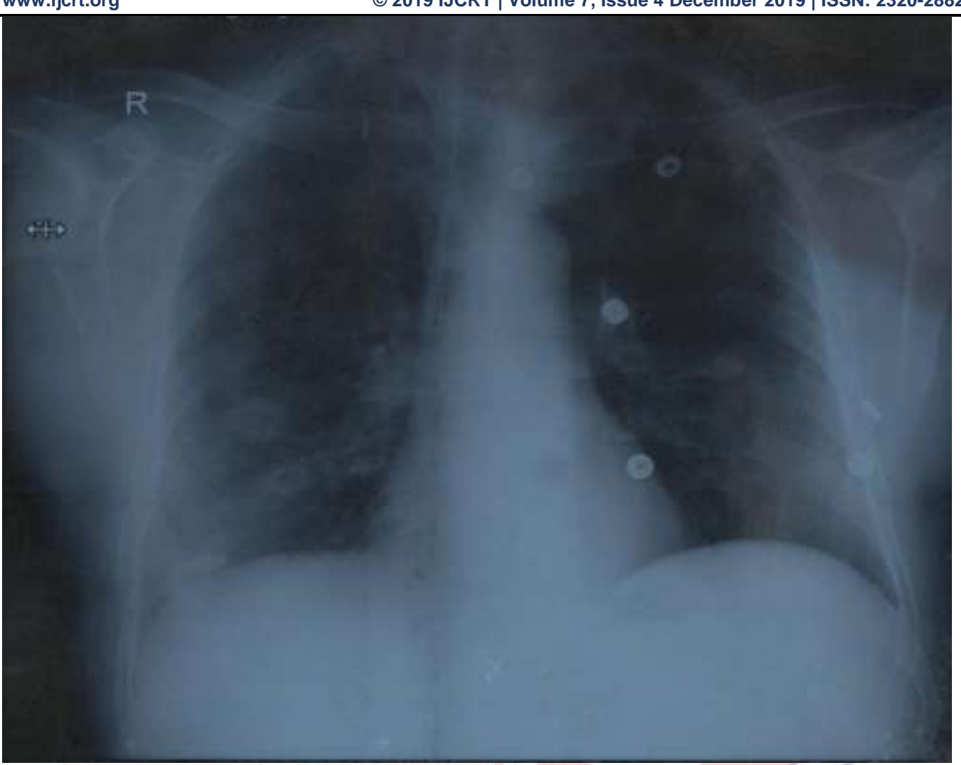
CXray after 3 weeks of treatment(showing resolution of bilateral pulmonary cavitation) JOR