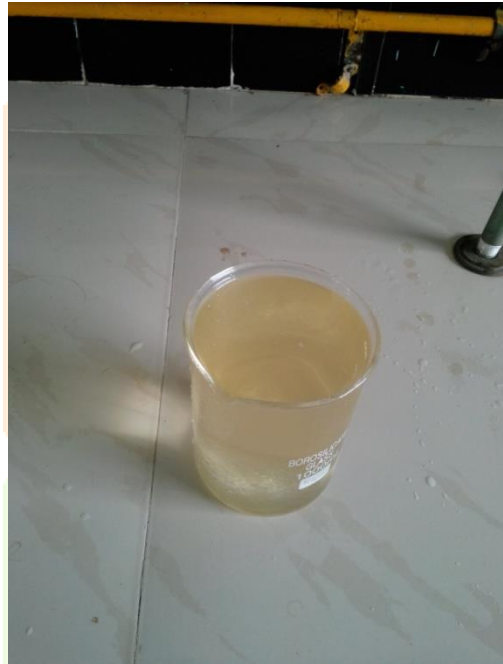
Fig1 .Supernatant ready for EC treatment

A waste water sample of Kitchen water is collected and a sample of 1000 ml from it will be tested for parameters like hardness, alkalinity, pH and chlorine content.