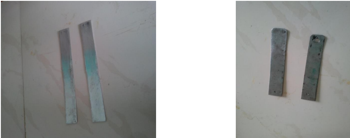
Figure2: Aluminium electrode (left) & Iron electrode (right).