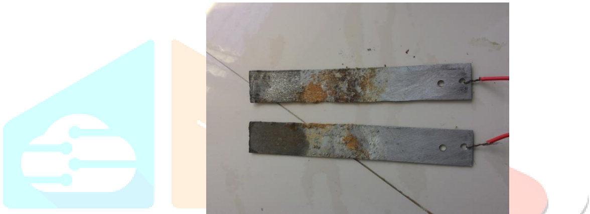
Figure3: Aluminium electrode after experimental run