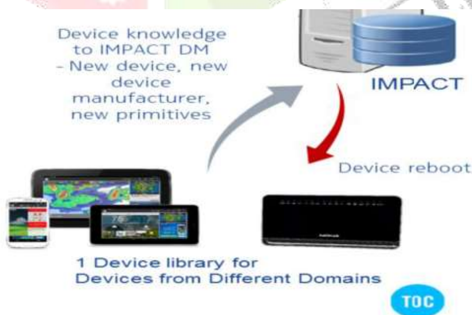
Figure 1: overview of device library for devices

In today's IT industry, we see that an organization needs to adapt itself dynamically to the changing needs of the IT needs. This implies that one need to automatically manage the services for all devices without complexity of configuring setting services manually. Figure 1 shows the overview of device from device library.