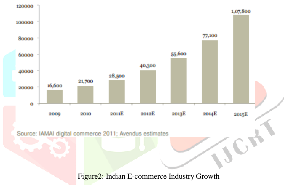
Figure2: Indian E-commerce Industry Growth