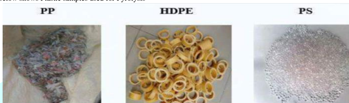
“Fig. 2.5-Samples of Shredded Plastic Waste”

The figure below shows Plastic samples used for Pyrolysis