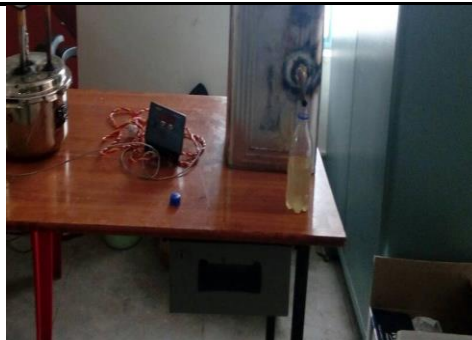
“Fig. 2.4- Experimental Setup”

The different polymers that are used as the feed for waste plastics are: