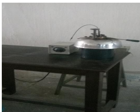
Fig3.4 Flash and Fire Point Test Apparatus