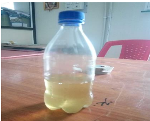
“Fig 3.1- Sample collected from Pyrolysis of Polystyrene”

The following figure shows Pyrolytic Oil collected after Pyrolysis of Polystyrene.