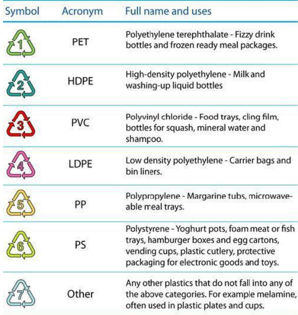
Table 2.1 – Classifications of Plastics:”