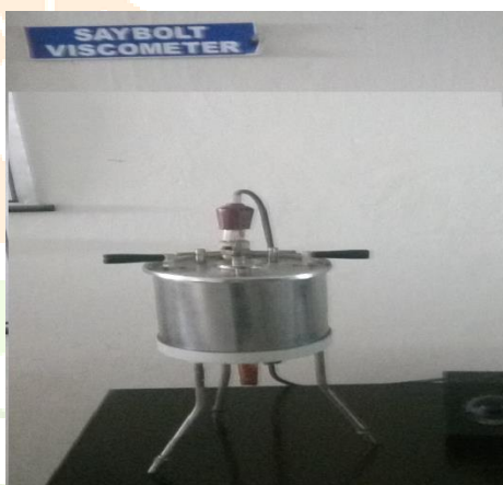
"Fig. 3.3 Saybolt Viscometer"