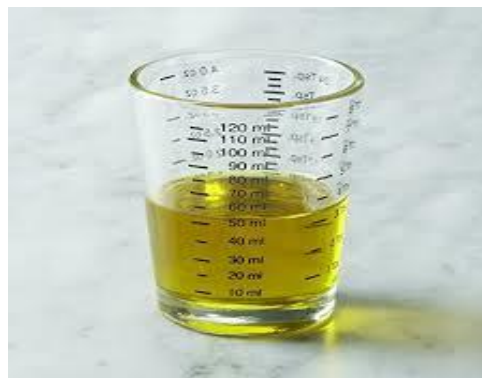
Fig 3.5 Plastic fuel in a Graduated Beaker

The Thermo-Physical properties are calculated and found using the mentioned Instruments and the results obtained are tabulated and compared with the conventional fuels like Gasoline and Diesel in Table 3.1