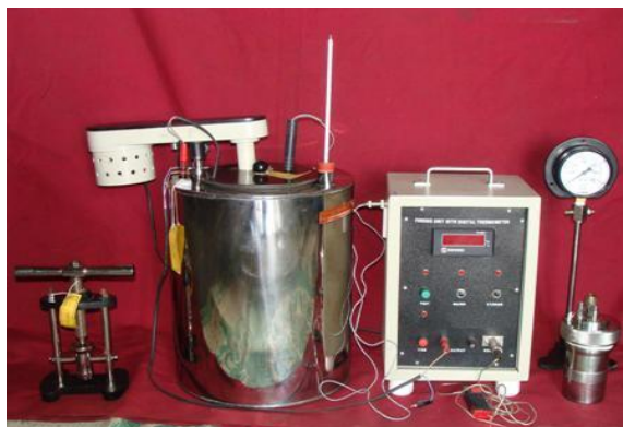
"Fig 3.2 Bomb Calorimeter"