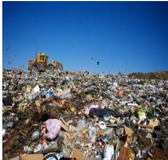
“Fig 2.1-Typical Plastic Landfill”

This is a terrible waste of a valuable resource containing a high level of latent energy. In recent year this practice has become less and less desirable due to opposition from Government and environmentally conscious community groups. The value of plastics going to landfill is showing a marginal reduction despite extensive community awareness and education programs. Research Centre for Fuel Generation (RCFG) has conducted successful 300 successful pilot trials and commercial trials for conversion of waste plastic materials into high grade industrial fuel. The system uses liquefaction, Pyrolysis and the catalytic breakdown of plastic materials and conversion into industrial fuel and gases. The system can handle the majority of plastic materials that are currently being sent to landfill or which have a low recycle value. Catalytic conversion of waste plastic into high value product is a superior method of reusing this valuable resource.