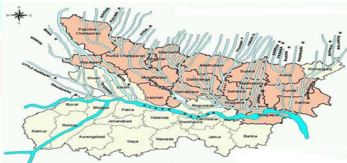
Fig. 2 River Ganga in State Bihar, India

The village Harkhi Pipra, town Shahpur, district Bhojpur, state Bihar, India along the bank of river Ganga (as shown in Fig. 2) was taken for the study of design and working of ITP. According to the census 2011, population of the target village was found to be 3136. Population in the year 2001 was 1962. The village did not have WTP or WWTP for the piped-water supply or sewage treatment respectively. The domestic wastes, agricultural wastes etc. was directly discharged into the river Ganga [7].