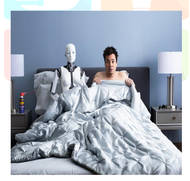
Figure 4.5 Robots as Pets/Friend/Spouse

AI can help to solve/fill the gap of maturity including growing babies and idiots by training their attitudes/mind etc. As per the psychology, maturity refers to the ability to resp<mark>ond to the situation(s)</mark> being aware of the appropriate time and location to perform and realizing when to act, according to the situations and the culture of the society one lives in.