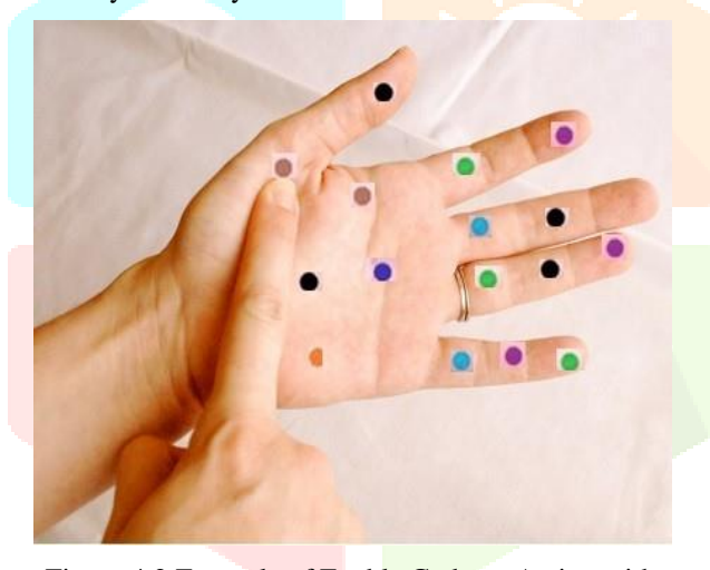
Figure 4.2 Example of Enable Gadgets Action with Empty Hands

Finding a compatible Lover or Wife is really a challenging task since ages, as time goes in the relationship, the definition of compatibility diluted and reasons would be ego, misunderstanding, lack of give-and-take policy, responsibility taking, sharing thoughts...N(not limited!). Even many sites talks about matching compatible parameters however all those data pointers are fed/manipulated by us directly/indirectly.