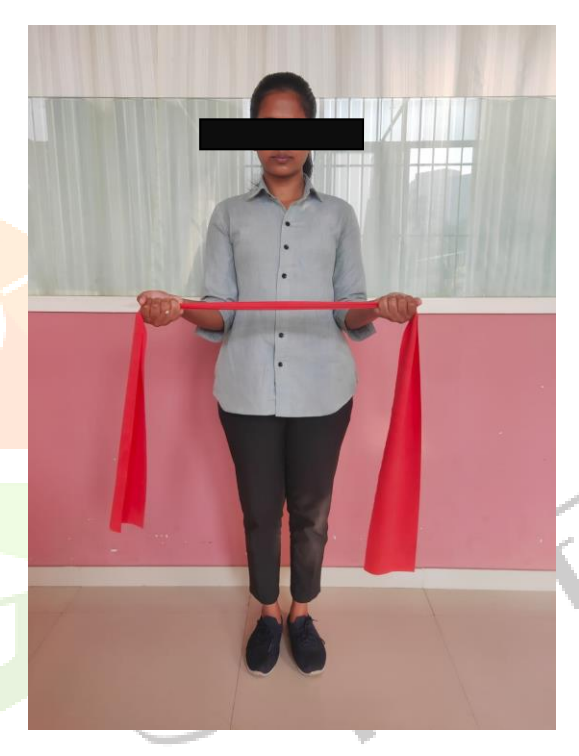
(A) Stretching of Upper Trapezius muscle (B)Strengthening of Rhomboid muscle

GROUP B: Stretching of Pectoralis muscle and strengthening of middle, trapezius muscle.