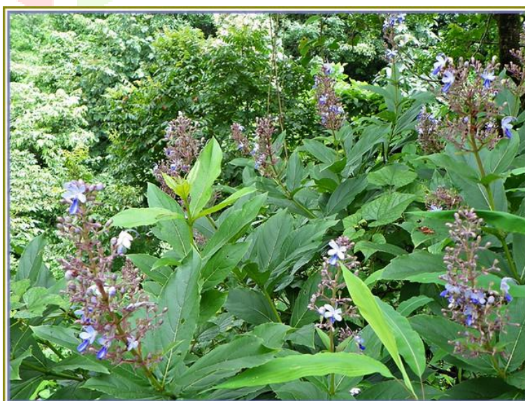
Fig. 1 Clerodendrum serratum