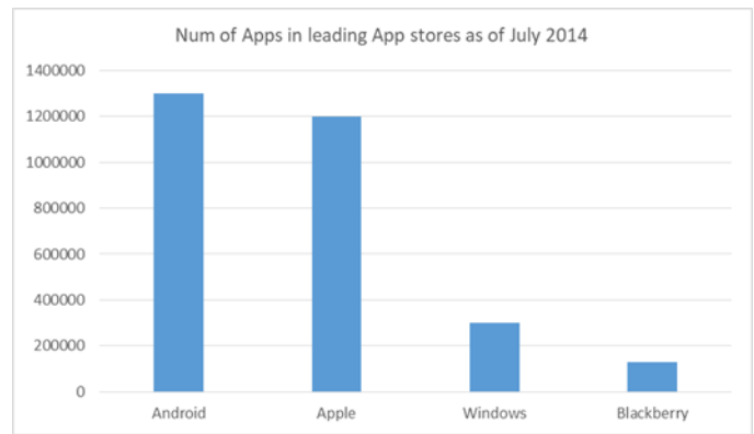
Fig2. Application Store statistics as of July 2014

Fig 2 and 3 shows the statistics as of July 2014 and March 2017 respectively, according to statistics [7] the total number of applications in the android market (Google Play) was at 2.8 million from 1.3 million in July 2014. Apple remains the second biggest with 2.2 million apps in the market (Apple App Store) from 1.2 in July 2014. Windows is the third largest with approximately 669 thousand applications in the market (Windows Store) from 300 thousand applications in 2014. Amazon comes fourth with 600 thousand applications in its Amazon Appstore as at March 2017. Blackberry comes fifth with approximately 234 500 applications as at March 2017 in its Blackberry world from 130 000 in June 2014.