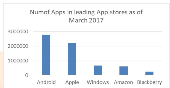
Fig3. Application Store statistics as of March 2017