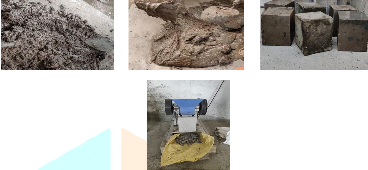
Figure 1 Various steps in the manufacturing of Geopolymer Aggregate

The cubical shape of the samples are preferred for the production of geopolymer aggregate, as the cylindrical samples have curved surfaces which do not aid in the production of the angular aggregate, The optimum proportion of the raw materials is obtained based on the compressive strength results at 28 days, cubical samples of size 100mm x 100mm x 100mm is casted for obtaining the compressive strength and the same samples are casted for obtaining the geopolymer aggregate. Hand mixing of the samples are preferred over machine mixing as there is loss in material for machine mixing, the geopolymer paste is filled in the moulds in layers, with each layer being given even amount of pressure and vibrators are used to remove the entrapped in air in the geopolymeric paste. Ambient curing is followed as the thermal curing will affect the thermal conductivity of the aggregate so formed from it.