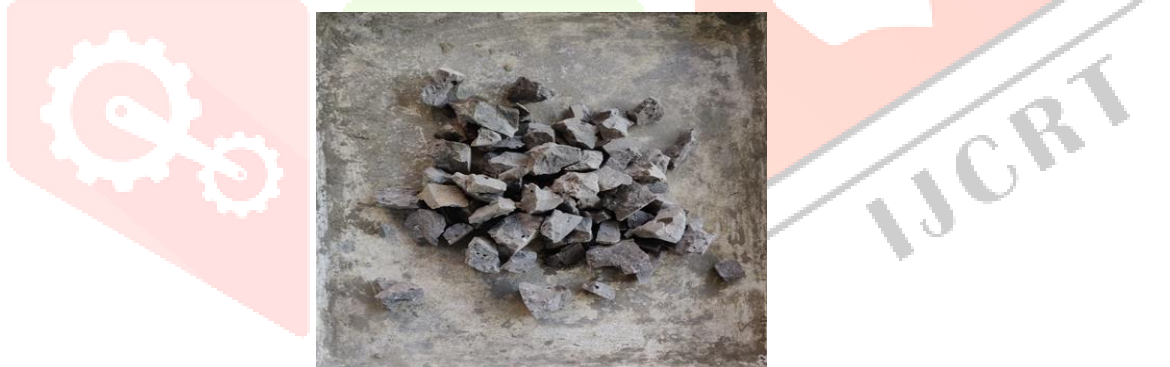
Figure 2 Geopolymer Coarse Aggregate

The trial proportion of 80% fly ash 20% kaolin and sodium silicate sodium hydroxide ratio 2.5 gave a compressive strength of 54MPa at 28 days, the ratio of 2.5 gave better strength and the geopolymeric past was at a good workable consistency, for the production of the geopolymer aggregate the cubical samples are casted for the above optimum proportion and ambient cured for 28 days and then crushed with the help of pulverizer the aggregate of size 20mm was obtained after crushing from the crusher.