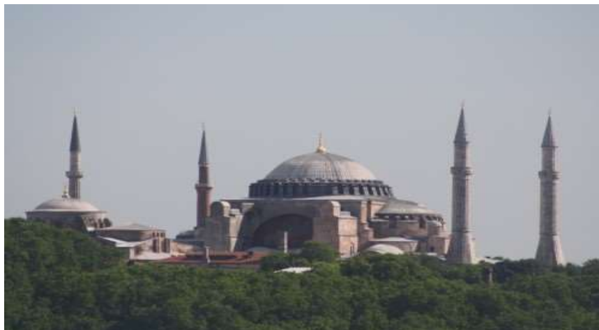
Fig.1. Three Dimensional View of Hagia Sophia

Byzantium was in the 5th and 6th century's center famous for architecture in Europe. It looks with extreme beauty such as golden mosaics and carved birds that pleasure an Emperor. The structure stands for complex accretion of myth, symbol, and history. Turkey in a kind of Gordian knot, confounding preservationists who want to save it from decay and restore its form glory. It is also symbolic of a heavenly place (2) . Byzantium is now called Istanbul. It is the capital of Turkey. It is also called seven hills city. Istanbul has become a world heritage site since 1985 (3) . It is a unique city founded in two continents, Europe and Asia. The city is divided by Bosphorus. The old city (Byzantium) was situated on the European side. The most imposing achievement of Byzantine architecture is the Church of Holy Wisdom or Hagia Sophia (4,5) . It was constructed in a short span of five years (B.C.537–532).