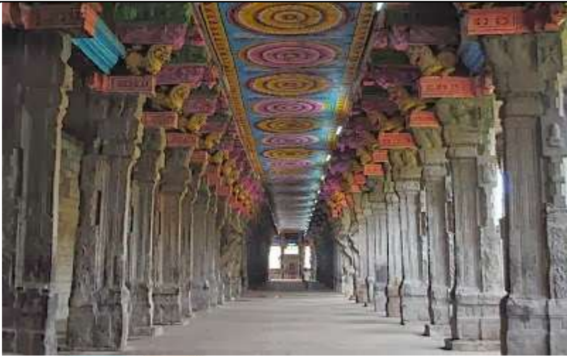
Fig. 6. Thousand pillars Mandapam at Madurai Meenakshi Temple.