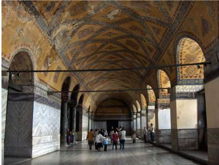
Fig. 2. Entrance Hall to Hagia Sophia.

The central part of this third and final version of Hagia Sophia was designed as a rectangle 250 feet X 220 feet. The top dome was supported by four huge columns at the corners of the square and it was from 40 equally spaced ribs. At the dome's base, 40 windows were there creating the sensation that the dome actually floated over the church.