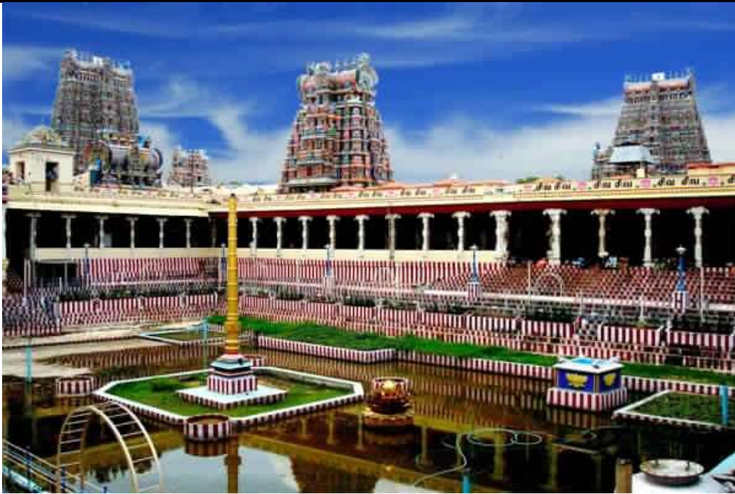
Fig.4. A Photo Graphic View of Porthamarai Kulam.