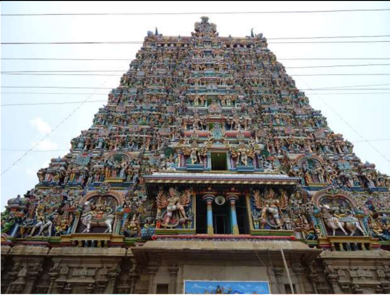
Fig. 3. Madurai Meenakshi Amman Temple South Tower.

3. Porthamarai Kulam: It is the sacred Pond with a Golden Lotus known as Porthamarai Kulam located inside the temple, a very holy site for devotees. and people have to go around the tank to enter the main shrine.