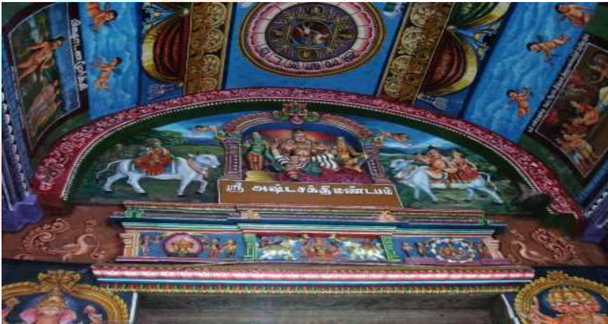
Fig. 7. Ashta Shakthi Mandapam for Eastern Entrance.